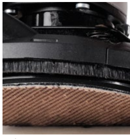
Abranet<sup>®</sup> Ace HD Ceramic grain, strong and rough