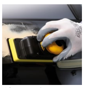
Abranet® The original sanding net

Since then, our focus has been on improving the net-abrasive properties for different customer needs. The product family has grown with several new members. We expect more new family members in the near future.