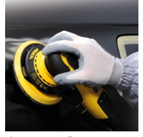
Autonet<sup>®</sup> For metal surfaces