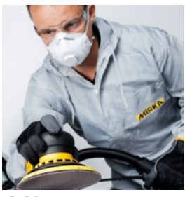
OSP Optimised surface preparation system