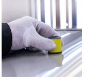
Abranet<sup>®</sup> Soft Gentle and soft